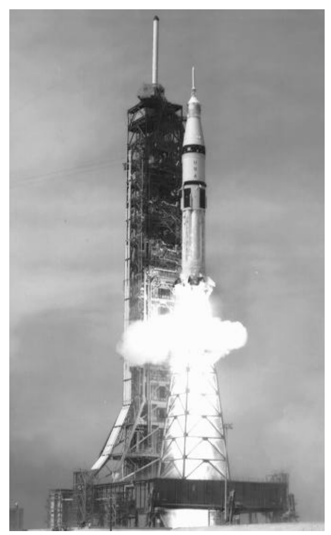
The three manned Skylab missions and the Apollo-Soyuz Test Project (ASTP) were launched from Pad 39B using the Saturn IB rocket.

scientific payload of 28 experiments supplied a rich harvest of data in many fields.