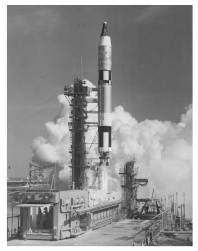
Ten Gemini Earth orbital missions were launched from Complex 19 using the Titan II rocket.

The Saturn V first stage was to use a cluster of five F-1 engines that would generate 33,360,000 newtons (7.5 million pounds) of thrust. The second stage utilized a cluster of five J-2 engines that developed a combined thrust of 4.4 million newtons (one million pounds). The third stage was powered by a single J-2 engine with 889,600 newtons (200,000 pounds) thrust capability. IBM already had started the development of the instrument unit for the Saturn V.