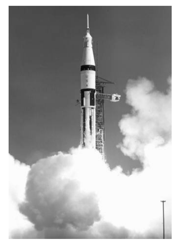
A Saturn IB rocket lifts Apollo 7 into Earth orbit from Complex 34 at Cape Canaveral. It was the first manned Apollo flight.

Apollo 14 was retargeted to accomplish the mission planned for Apollo 13. The spacecraft was launched at