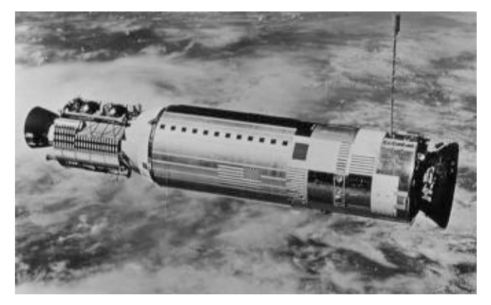
The Agena Target Docking Vehicle as seen from the Gemini 12 spacecraft during rendezvous.

The highest altitude reached by the manned Gemini spacecraft — a world's record at that time — was 1,372.8 kilometers (853 miles) during the Gemini 11 mission.