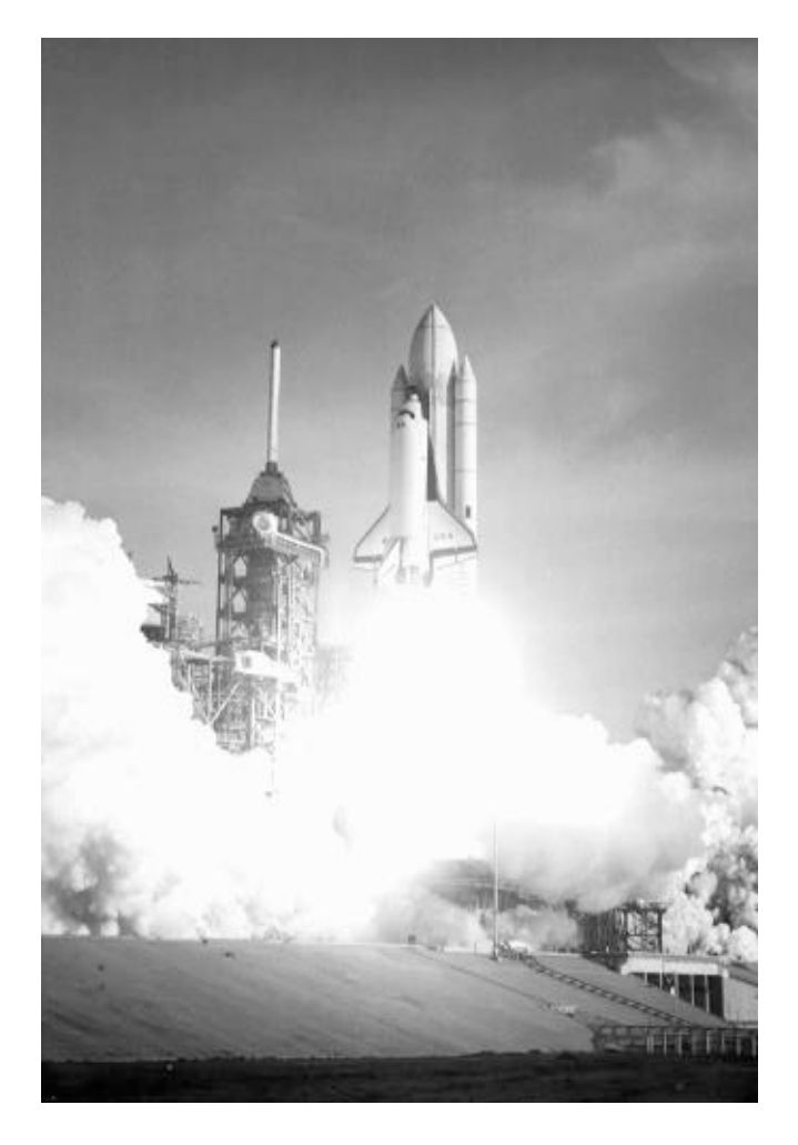
First (STS-1) liftoff of the Space Shuttle, April 12, 1981.

The Space Shuttle has flown with one crew of eight men and women, and seven crew members has been a common number. It has combined thrust at liftoff of about 28.6 million newtons (6.5 million pounds) from its two solid rocket boosters and the three liquid-propellant main engines on the orbiter. Its top capacity into low Earth orbit will be 29,500 kilograms (65,000 pounds) in its fully operational configuration. This can consist of one large payload; a combination of up to three spacecraft with attached solid stages for injection into higher orbits, along with smaller packages that remain with the orbiter, but must operate in the space environment; or a mixture of these types of payloads. The Space Shuttle is the only American vehicle designed for both manned spaceflight and delivering heavy payloads into Earth orbit that is expected to be available for the rest of this century.