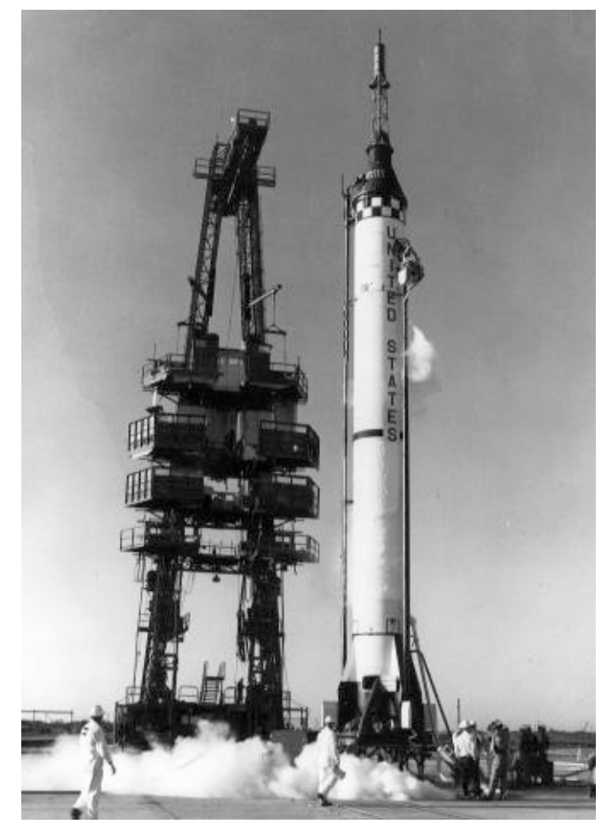
Preparations for the launch of Alan Shepard aboard a Redstone rocket from Complex 5 at Cape Canaveral.

Astronaut Walter N. Schirra, Jr., doubled the flight time in space and orbited six times, landing Sigma 7 in a Pacific recovery area. All prior landings had been in the Atlantic.