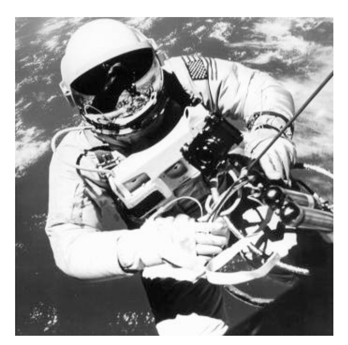
Gemini 4 Astronaut Ed White made America's first space walk on June 3, 1965, during the third orbit of a four-day mission.

On November 9, 1967, the first flight test of the Apollo/Saturn V space vehicle was successfully accomplished. Designated Apollo 4, the unmanned flight demonstrated excellent performance by the previously unflown first and second stages. It proved the restart-in-orbit capability of its third stage, the ability of the Apollo spacecraft to re-enter Earth's atmosphere at lunar mission return speeds, the overall performance of the integrated space vehicle, and the operational readiness of Kennedy Space Center Launch Complex 39. All mission objectives were met. The Saturn V placed a total weight of 126,418 kilograms (278,699 pounds) in orbit after a near-perfect