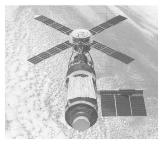
Skylab, orbiting 270 miles above the Earth, was both workshop and home for three teams of astronauts. The Skylab space station was inhabited for a total of 171 days.

*Includes rockets, engines, spacecraft, tracking and data acquisition, operations, operations support, and facilities.