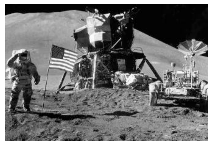
Standing on the Moon, Apollo 15 Astronaut James Irwin salutes the flag alongside the Lunar Module and Lunar Rover.

The final Apollo mission, Apollo 17, was launched December 7, 1972. On the 12-day mission the astronauts explored the Taurus-Littrow landing site, emplaced geophysical instruments, and collected over 108 kilograms (240 pounds) of samples. The total surface time outside the Lunar Module was 22 hours and 4 minutes, exceeding by almost two hours the previous record held by Apollo 16. The Command Module pilot again operated scientific instruments and cameras in lunar orbit, then retrieved the